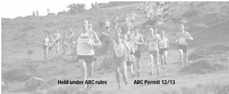
Held under ARC rules ARC Permit 12/13