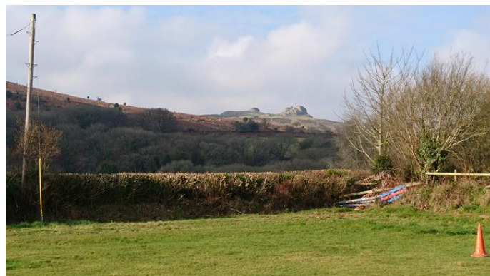
Camping in the shadow of Haytor Rock

Visit www.teignbridgetrotters.co.uk/our-races/haytor-heller for further information and an up to date list of entries