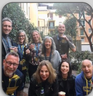
Some of the gang from Rome

I'm currently looking into hotels and will keep you updated.